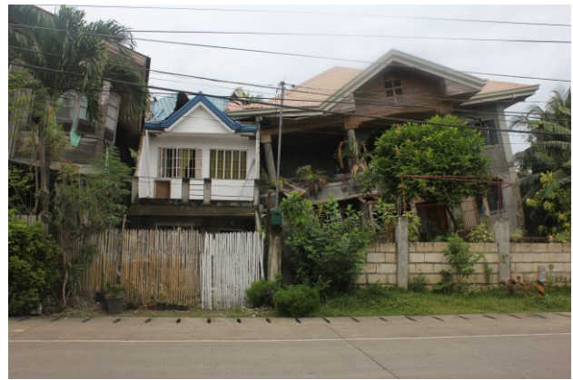
Fig. 5. tilting of two residential houses due to column failure