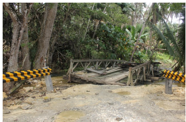
Fig.7 Failure of a Bailey bridge in Catigbian.