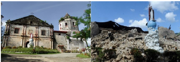
Fig. 14. St. Vincent Ferrer Church in Maribojoc, before and after the earthquake