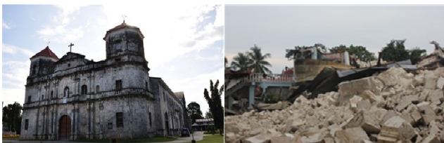
Fig. 15. Our Lady of Light Church in Loon, before and after the earthquake

A summary 7) of the damaged cultural heritage properties in Bohol and Cebu are summarized in Tables 1 and 2.