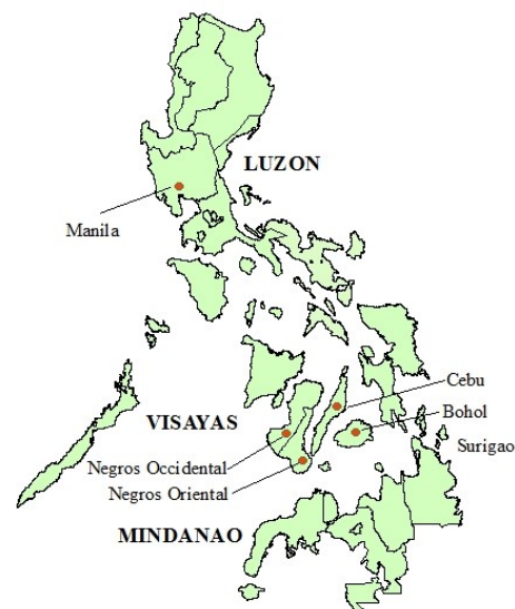
Fig. 1. Bohol Island, Philippines.

The earthquake was caused by a reverse thrust movement of a previously unidentified fault (see white dashed line in Fig. 2 ) and geologists are at present mapping the entire fault trace. The solid blue line in this figure is the trace of the East Bohol