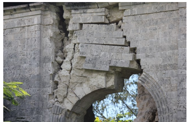
Fig. 11. Arch failure at Dausi Church