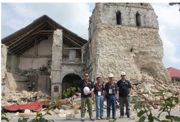
Fig. 13. Façade wall failure at the Our Lady of the Immaculate Conception in Baclayon