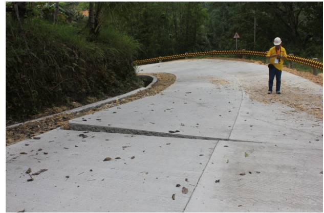
Fig.10 Large crack in concrete pavement.

Damage to a road section along Baclayon - Alburquerque – Loay highway was also observed probably to ground liquefaction was also seen.