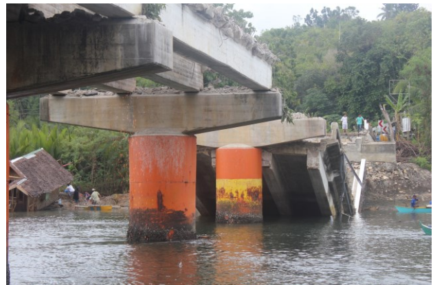
Fig.6 Unseated superstructure of Abatan bridge.

In Catigbian a bailey bridge with wooden deck swayed to one side while the other end fell into the river ( Fig. 7 ).