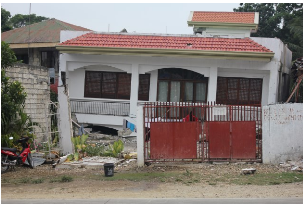
Fig. 4. Soft-storey column failure of a two-storey house.

Figure 4 exhibits a soft-storey failure where the ground floor columns failed and the ground floor was crushed by the second floor. In fig. 5 , the columns of the houses on the left and right failed causing it to lean on the house found in the middle of the photo. Other observed failures of houses are the following: (a) beam to column connection failure (b) corroded reinforcements (c) under reinforced columns (d) no lateral supports of walls and (e) inadequate anchorage.