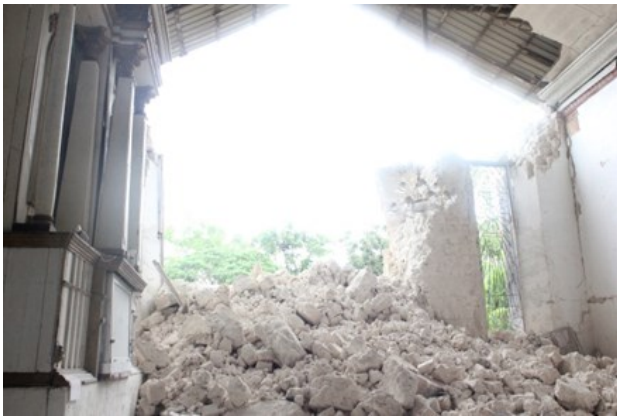
Fig. 12. Observed wall failure