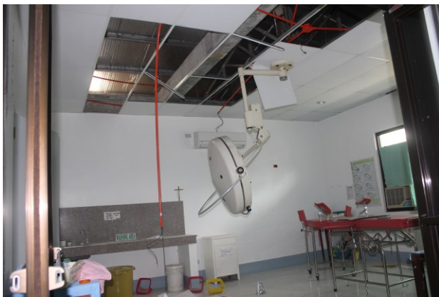
Fig.8 Non-structural damage to Catigbian District Hospital.

The Natalio P. Castillo Sr. Mermorial Hospital however ( Fig. 9 ) suffered major structural damage. This hospital was almost ready for occupancy but unfortunately was badly damaged during the earthquake. The building housing the emergency room located across this structure was also damaged and is now subject to detailed structural investigation.