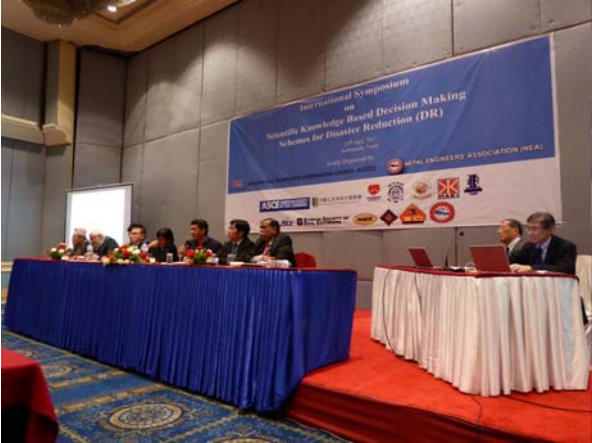
Photo 8 Panelists from eight ACECC member states discussed in the TC21 symposium about how to implement scientific knowledge-based decision-making for disaster risk reduction.