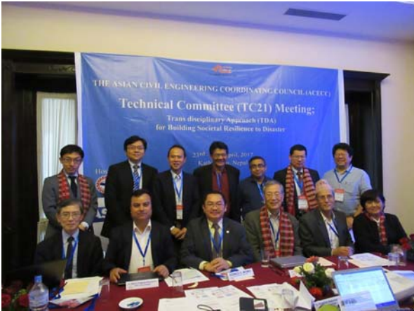
Photo 5 Thirteen representatives from CICHE, HAKI, JSCE, NEA, and PICE presented to the TC21 internal meeting on April 23 and made an intensive discussion for three hours.

http://www.acecc-world.org/TC21/index.htm