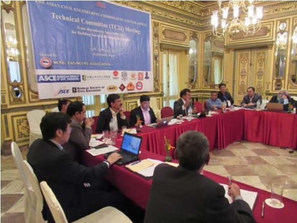
Photo 6 A number of agencies regarding the DRR including National Reconstruction Agency (NRA), Ministry of Urban Development, UNDP, and universities joined the stakeholders meeting on April 24th morning.