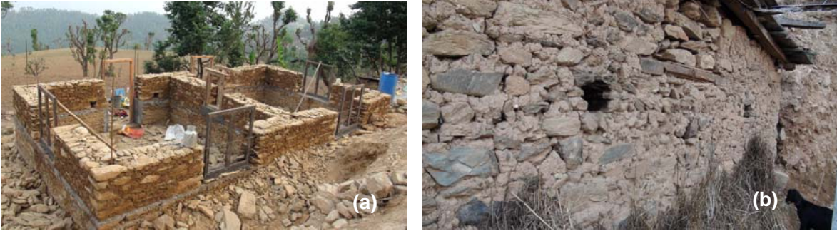
Photo 3 Reconstruction works of housings being performed in Irkhu Village, Sindhupalchowk District. (a) Housing under construction, showing the horizontal concrete reinforcement (band) placed between stone layers in contrast to the old warehouse without the horizontal reinforcement (b).