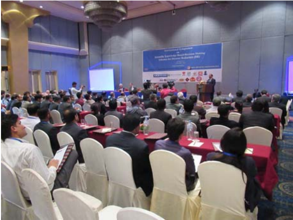
Photo 7 More than 250 experts participated in the TC21 symposium on April 24 afternoon with the considerable contribution of Nepal Engineers' Association (NEA).