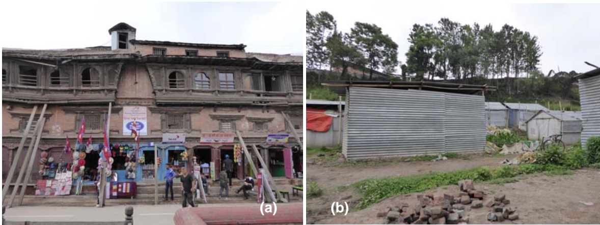
Photo 4 A number of historical buildings are being reconstructed in the ancient city, Bhaktapur. The left photo shows a building supported by timbers for anti-earthquake purpose. The right photo shows the temporary housings for the 2015 earthquake victims.