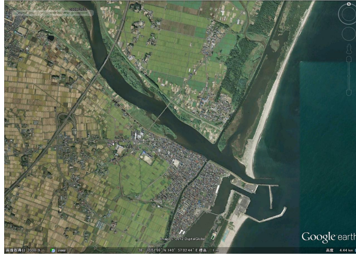
Before tsunami (31 March 2009)