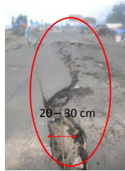
Break road due to liquefaction