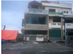
Nelayan restaurant 4 stairs became 3 stairs after earthquake