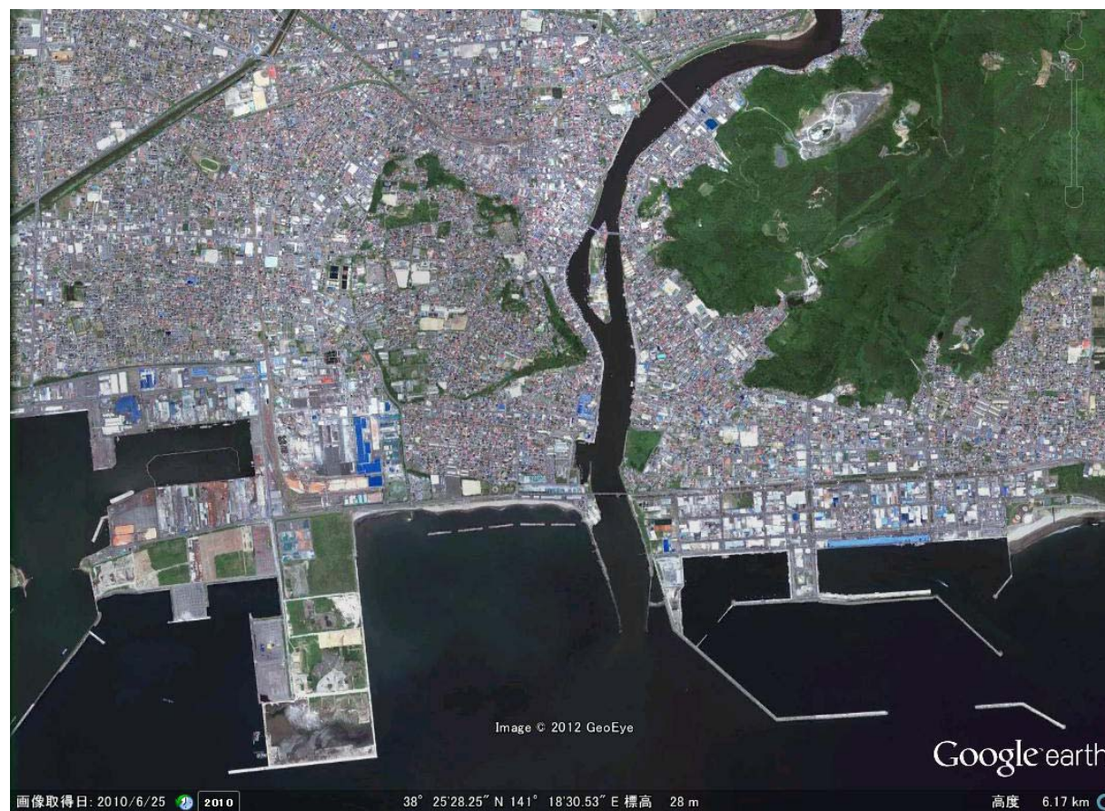
Before tsunami (25 June 2010)